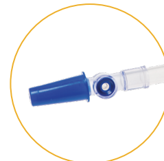
Needleless sampling port